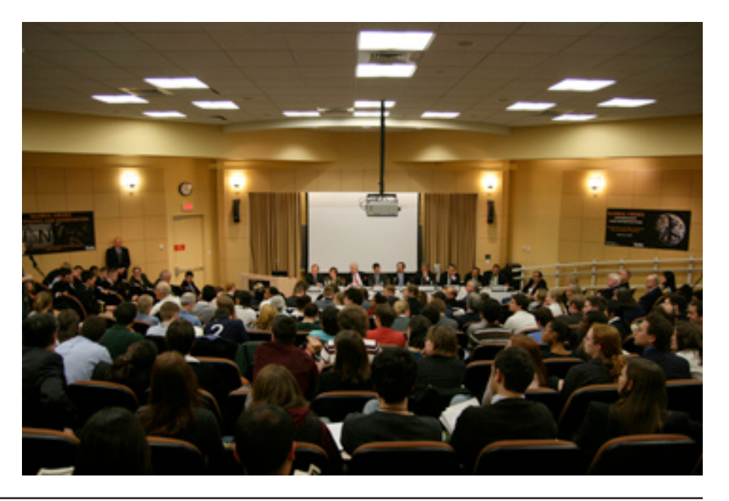
Institute for Global Leadership, Tufts University