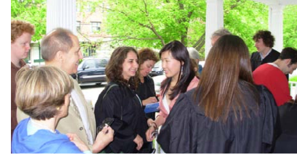
Every year, the IGL hosts a senior reception for graduating seniors and their families.

This year's graduating class of 54 also excelled in their academics: eight graduated with summa cum laude honors, 13 graduated with magna cum laude honors, and 12 graduated with cum laude honors; of the 24 with second majors, six graduated with magna cum laude honors in their second major and six with cum laude honors.